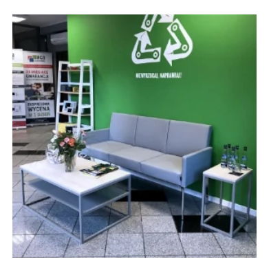
COOPERATION WITH RGB ELECTRONICS IS: